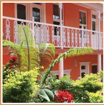
Sica's GUEST HOUSE