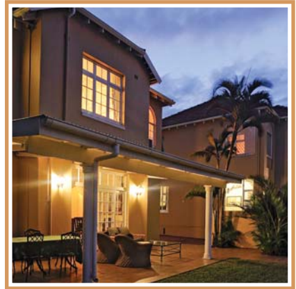
Sica's MUSGRAVE B&B