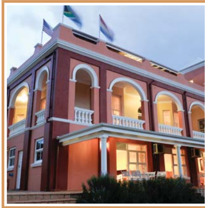
Sica's THE LOFT